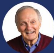
Alan Alda Mevinei Mada Award for Enhancing the Accessibility of Science