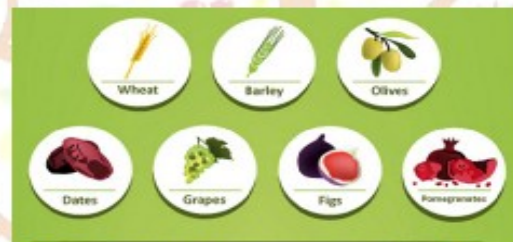
Tu BiShvat Vegetarian Seder Menu

There is no charge for the seder for temple members but please remember to RSVP specifying the number of attendees. There will be six, seven or eight persons per table in prearranged seating. Seating is limited so be sure to reserve early.